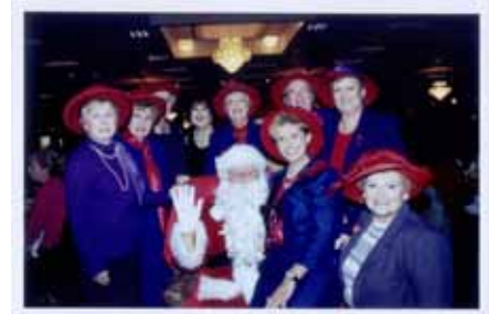
The Pearls of Platt Springs

I imagine the readers of this newsletter as a huge group of "unveiled faces" reflecting God's glory. Thank you for being a supporter of Killingsworth. Thank you for recognizing your "freedom through Jesus Christ" and serving with me on our mission of God's love, mercy, justice, charity and peace.